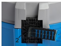
Step 2 - Fit bottom half