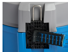
Step 3 - Fit pin