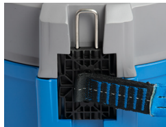
Step 2 - Remove pin