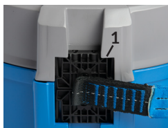
Step 1 - Fit top half