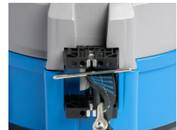
Step 4 - Pin Short Webbing Assembly