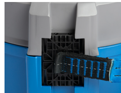
Step 3 - Pull out webbing