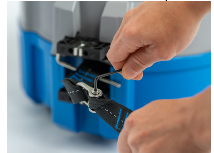
Correct shackle fit